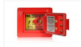
Remote Power Box