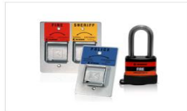
Gate Key Switches and Padlocks